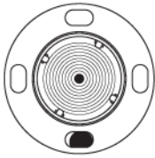
P x 1 (20101)