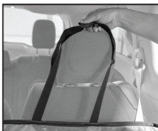
Place the clipped strap over the headrest.