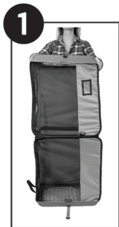
Stand the crate up on one end.