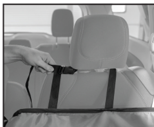
Tighten the strap for a secure fit. Repeat on the other side.