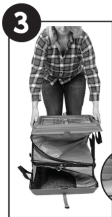
Continue to twist 180° until the clips meet up.