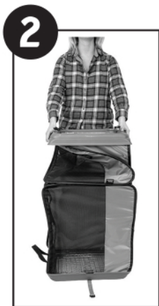
While holding the top, twist clockwise.