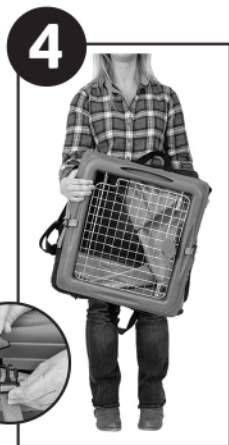
Secure both sides with the clip.